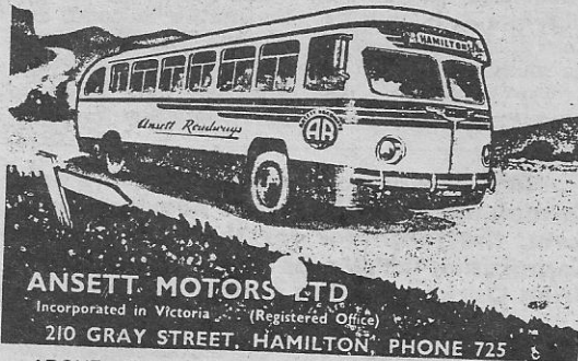
ABOVE: Part of an Ansett Roadways brochure, believed about 30 years old.